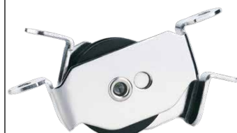
Sideplates rotate to insert preswaged/Nico-pressed wire fittings.