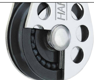
High-load composite bearings handle wire and high-strength line.